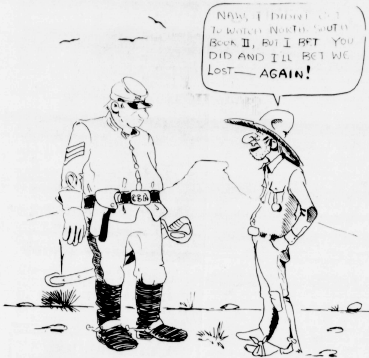
DALE HAMMOND © CASTLE PEAK ENT.