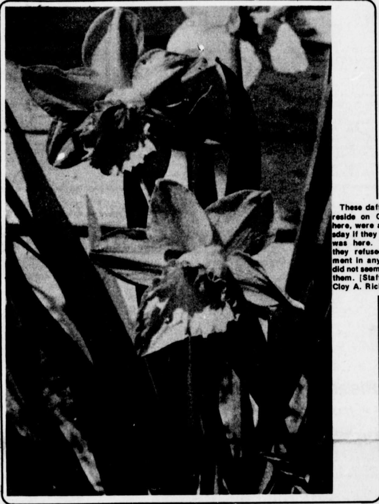
These daffodils, who reside on Oak Street here, were asked Tuesday if they felt Spring was here. They said they refused to comment in any way that did not seem natural to them.