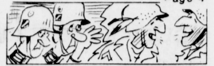
The Navajo language was used successfully as a code by the U.S. during World War II.

ALL WORK GUARANTEED ALL TYPES PLUMBING SUPPLY CONSOLIDATED PLUMBING Radio Dispatched Trucks For Fast Dependable Service 102 KENT 928-5627 or 928-5263 OLD & NEW WORK BACKHOE & TRENCHER