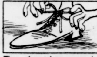
The shoestrapping was invented in England in 1790. Prior to this time, all shoes were fastened with buckles.

By Walter P. Morton Jr. Attorney for the Estate .53-1tc