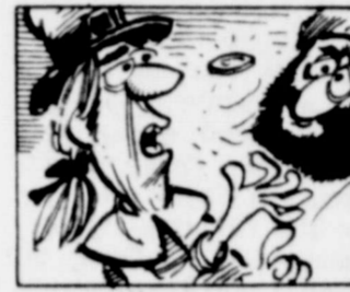
Portland, Oregon was named by the flip of a coin. The losing name was Boston.

CAN HAUL DIRT, ROCK & GRAVEL LEVEL & REPAIR DRIVEWAYS FREE ESTIMATES HAROLD WALKER 928-5872 202 CHERRY