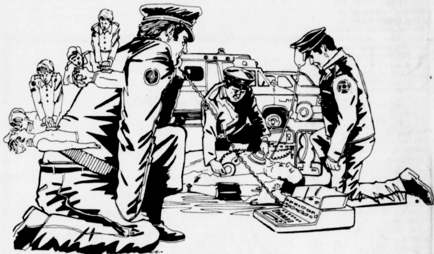
Fast response when an emergency exists.

Thursday, January 5, 1984...Merkel, Texas