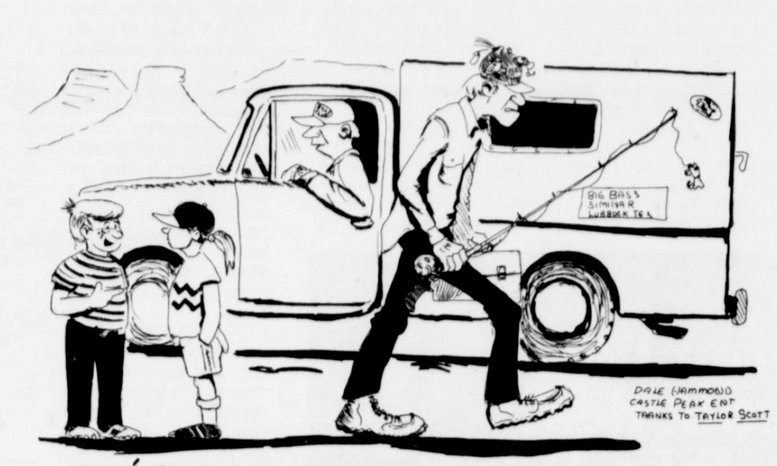
DADS GOTTA GO BACK TO SCHOOL. HE FLUNKED FISHING.