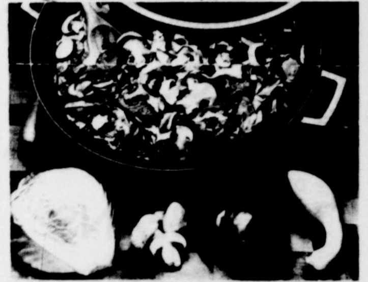
STIR-FRY CABBAGE is a quick and delightful summer treat for the entire family. Texas Department of Agriculture food specialists have combined Texas cabbage with mushrooms, squash, green peppes and sliced beef for a delicious all-in-one meal.

The couple plan a January 8 wedding in the First Baptist Church in Tye, Texas.