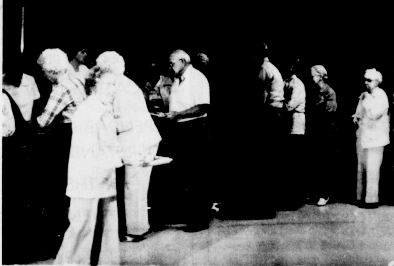
About 70 Merkel area Semor Citizens made it for the first meal of the Meals on Wheels

above 30 bushels per acre. No telling what the cotton market will be around harvest, but with last year's surplus, the prospects of a high price cannot be too bright.