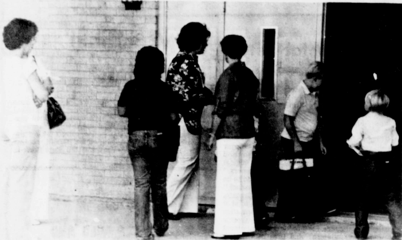
Mothers find out what class their children are to report to at Tuesday's first day of school.