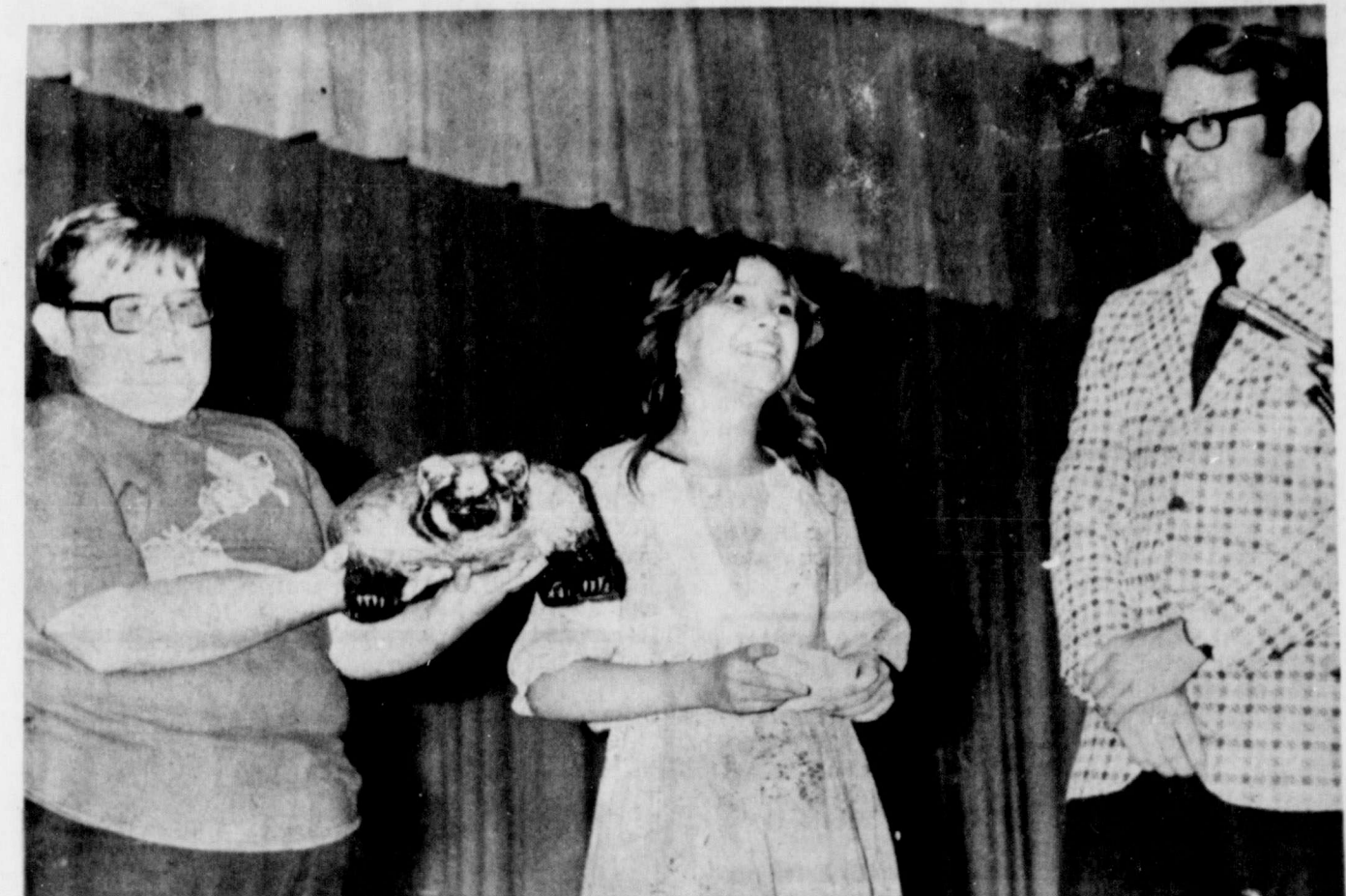
The fifth grade at Merkel Elementary School presented their school with a paper mache Badger as a class present.

We realize we will acquire a new freedom - to be our own boss, to make our own decisions and to be responsible for their outcome. This is the very thing we are going to have to feel equipped to do -- be responsib for the outcome of our own decisions. We hope you all will have faith in us as we confront these areas of adjustment. Again these are responsibilities that we must do for ourselves - not by ourselves. We appreciate everything you as friends, teachers and families have given us along the way, and as we say farewell to you tonight at graduation, we hope you will still be there in your old familiar place when we need you. Maybe someday in our own small way we can repay you for your confidence in us. Again we thank you all very much and we hope your prayers will go with us from this night on.