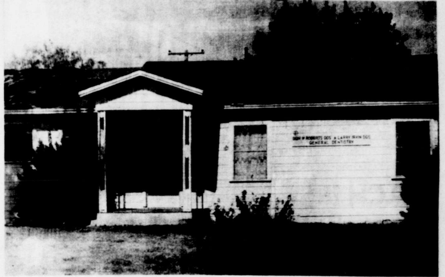
New Dentist office in Merkel ...to benefit area Merkelites.