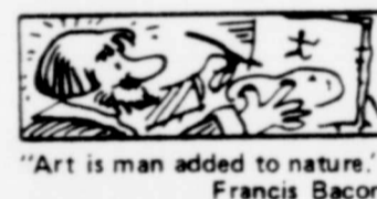
"Art is man added to nature." Francis Bacon