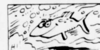
Fish have been seen at ocean depths of almost 7 miles.