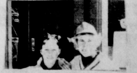
Wonder who these two lovelies are?