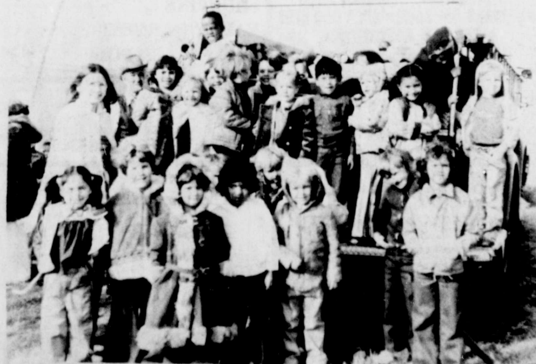
Merkel Fire Department Treats Kindergarten and 1st Grade Children

represented Merkel as F. F. A. Sweetheart for 1976-1977.