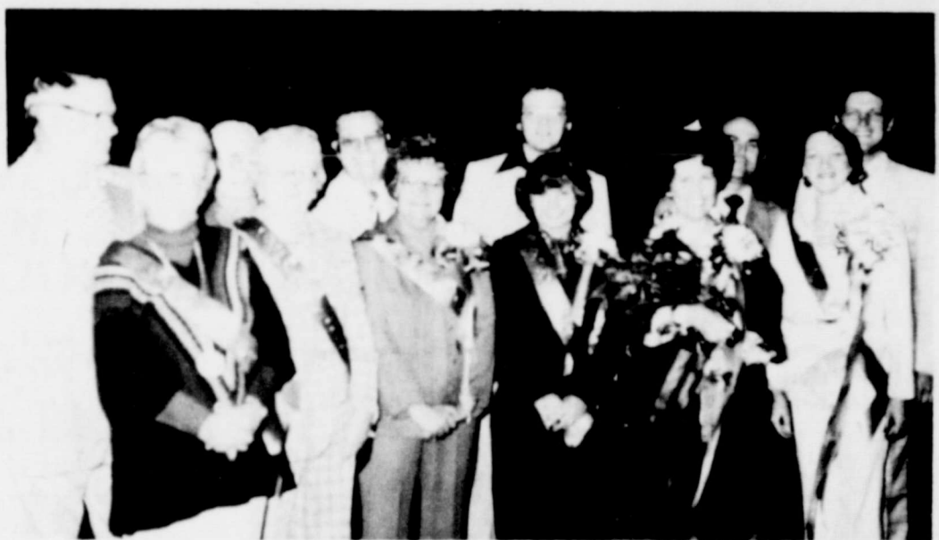
EXES ATTENDING TRENT HOMECOMING ...at Friday night football game