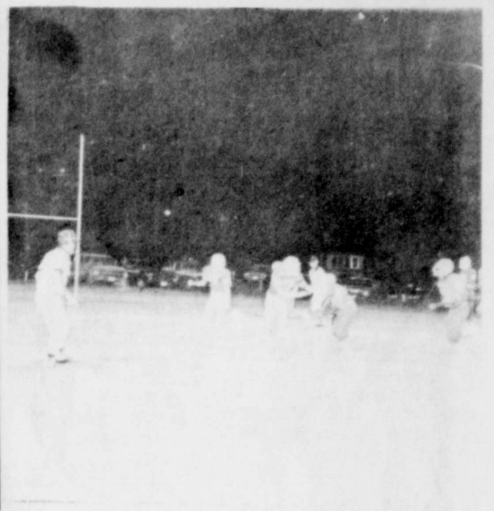
ABOUT TO GET TACKLED--Trent runner is about to get tackled Friday night as the Gorillas handed McCaulley a 82-49 defeat.