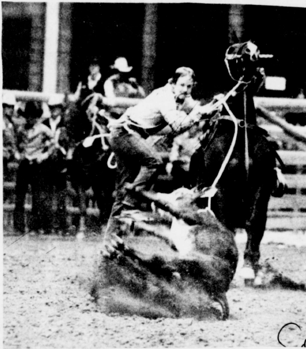
ROPING CONTEST WINNER

Our love should not be just words and talk; it must be true love, which shows itself in action.—1 John 3:18