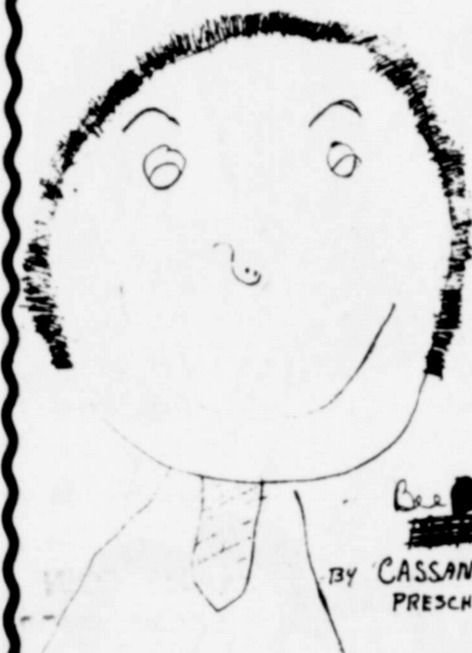
MORENO BY CASSANDRA MORENO PRESCHOOL