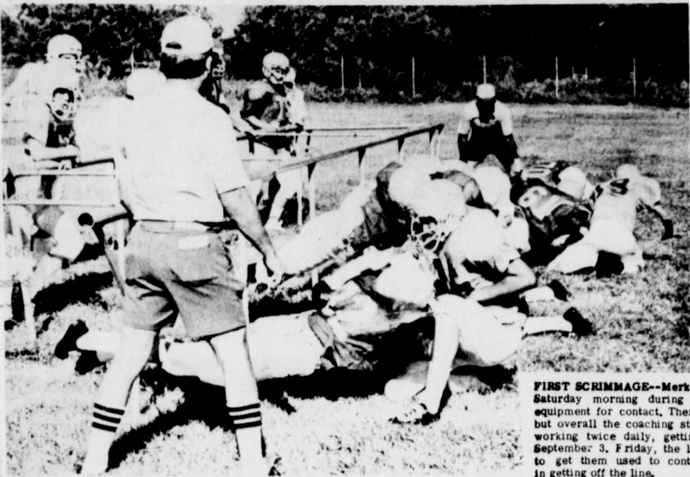
FIRST SCRIMMAGE --Merkel High ran through a scrimmage Saturday morning during the second day of work in full equipment for contact. There were some rusty spots evident, but overall the coaching staff praised the efforts of all those working twice daily, getting ready for the season opener September 3. Friday, the linemen were going through drills to get them used to contact and to get down their timing in getting off the line.