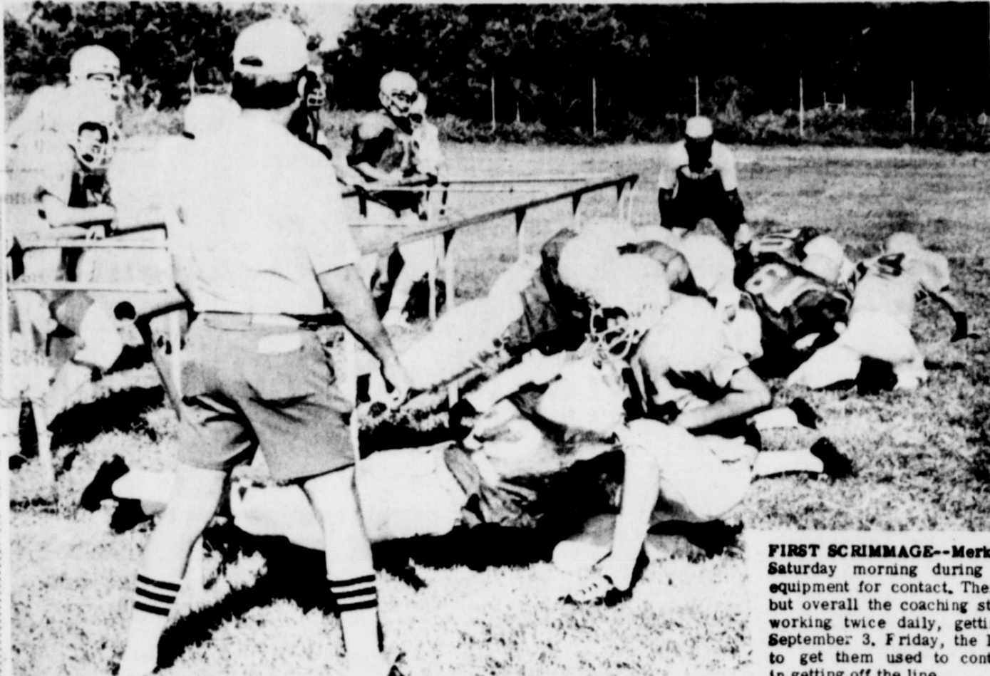
FIRST SCRIMMAGE --Merkel High ran through a scrimmage Saturday morning during the second day of work in full equipment for contact. There were some rusty spots evident, but overall the coaching staff praised the efforts of all those working twice daily, getting ready for the season opener September 3. Friday, the linemen were going through drills to get them used to contact and to get down their timing in getting off the line.