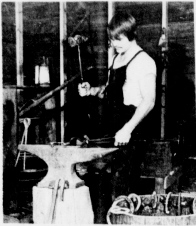
The transportation mechanic of years ago was the blacksmith, with his glowing hearth, hot iron and heavy hammer. This past will live again October 25 as the Panhandle-Plains Historical Museum opens the doors of its Pioneer Village for the Bicentennial Ball.