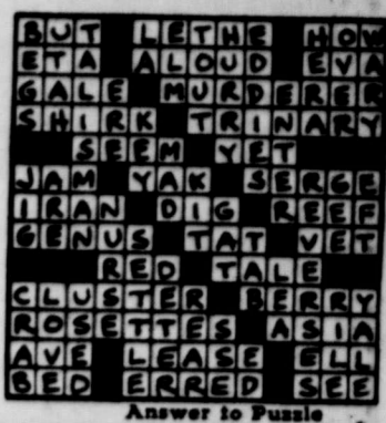
Answer to Puzzle