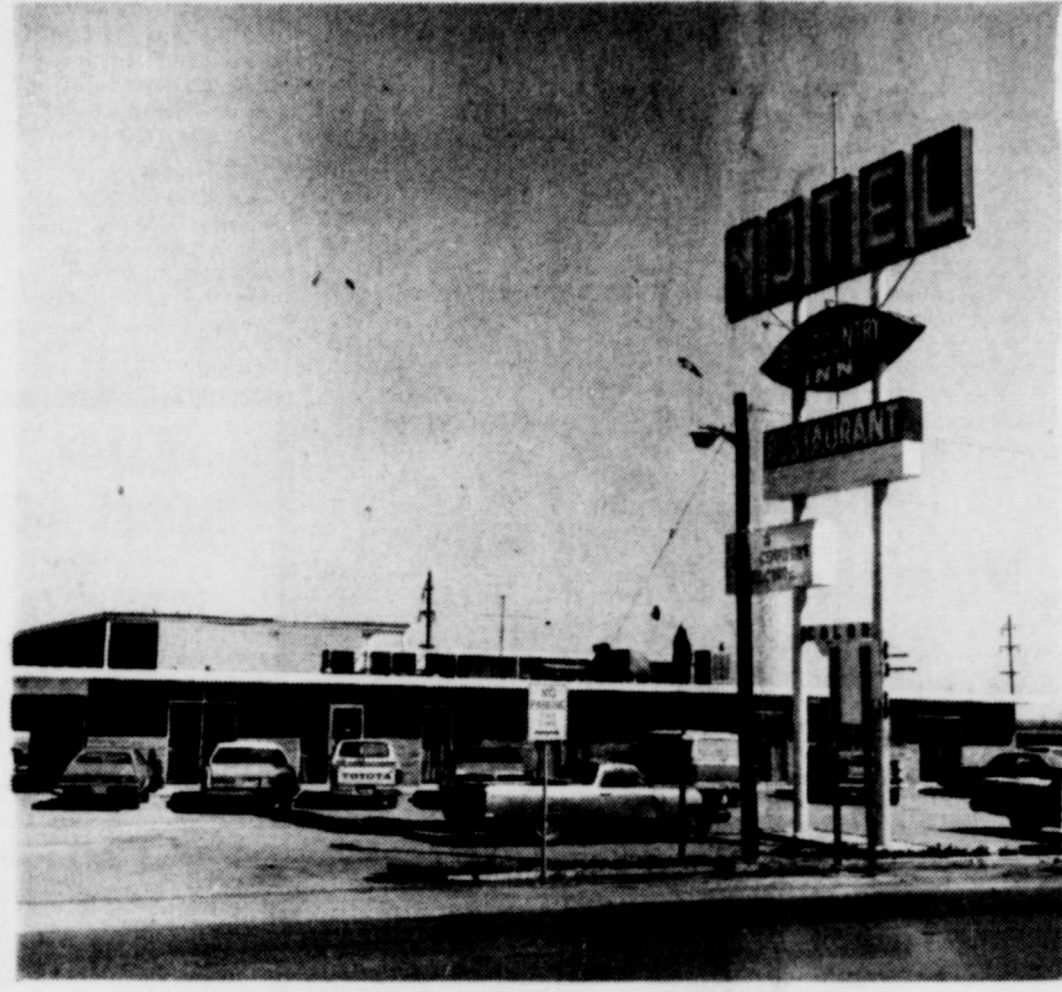
BIG COUNTRY INN ...formerly Asteroid