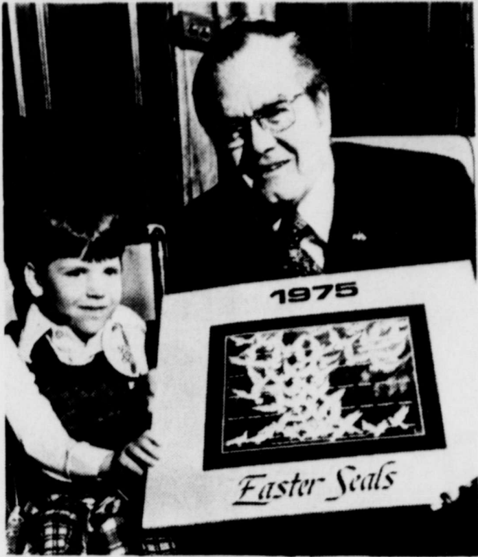
GOV. DOLPH BRISCOE ... with Easter Seal child