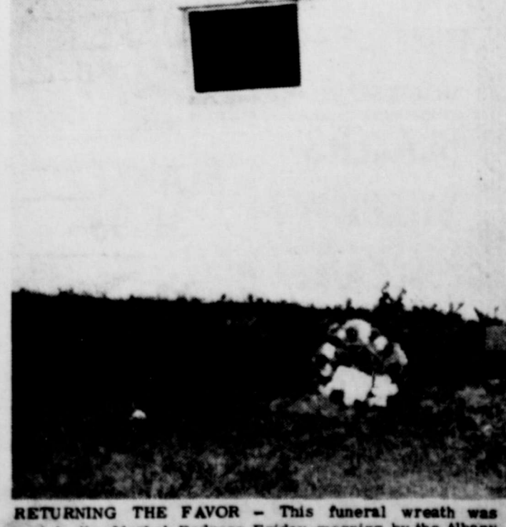
RETURNING THE FAVOR — This funeral wreath was sent to the Merkel Badgers Friday morning by the Albany Lions. After the Badgers beat the Lions, the Merkel pep squad placed the wreath at the door of the Albany team.