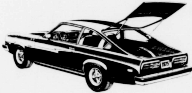
ASTRE GT 2-DOOR HATCHBACK COUPE