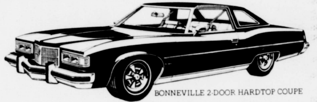
BONNEVILLE 2-DOOR HARDTOP COUPE