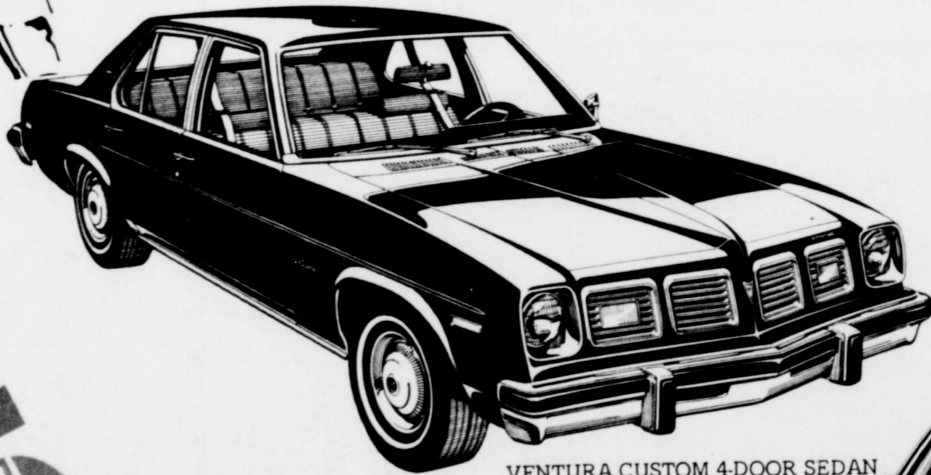
VENTURA CUSTOM 4-DOOR SEDAN