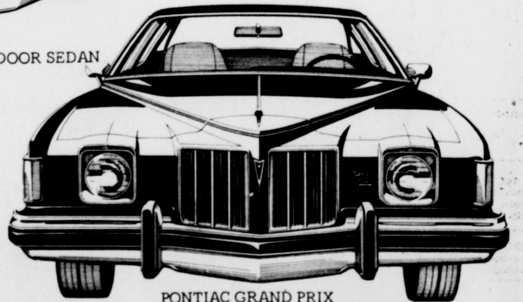
PONTIAC GRAND PRIX