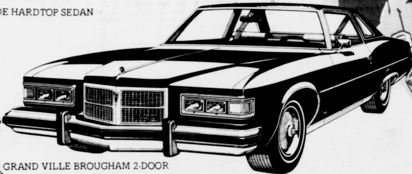
GRAND VILLE BROUGHAM 2-DOOR HARDTOP COUPE