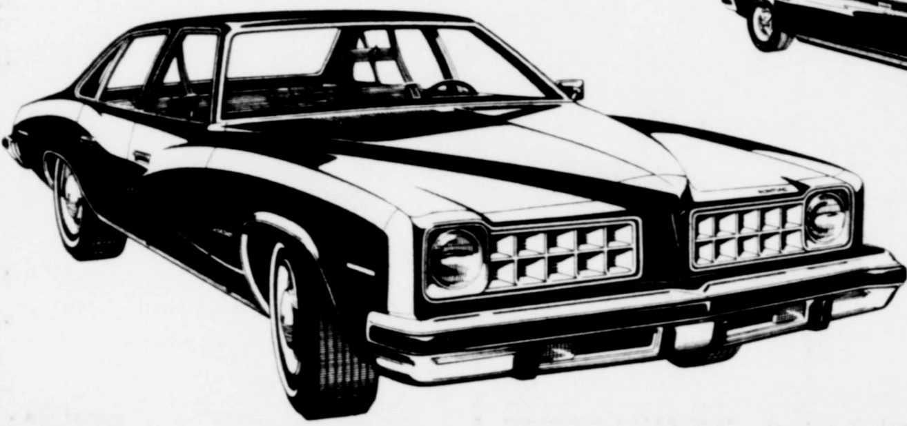
LeMANS 4-DOOR COLONNADE HARDTOP SEDAN