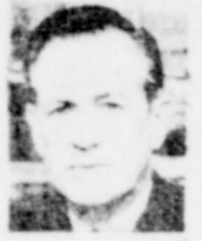
31 REP. OMAR BURLISON 17th District, Texas

WASHINGTON, D.C.—Congressman Omar Burleson reminds young men who are interested in competing for nominations to the service academies, for the class entering July 1975, he uses a competitive method of selection so that all young men who meet the necessary requirements may be considered.