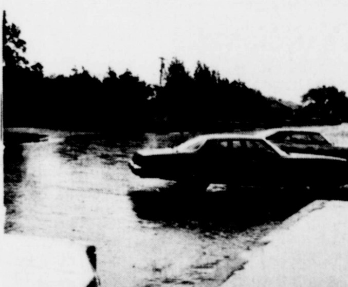
AND THE RAINS CAME-Well it finally happened Monday and people in and around Merkel, were the happiest folks in seven counties. Reports of up to 5 inches were called in by The Merkel Mail. (Photo by Troy Barnes).