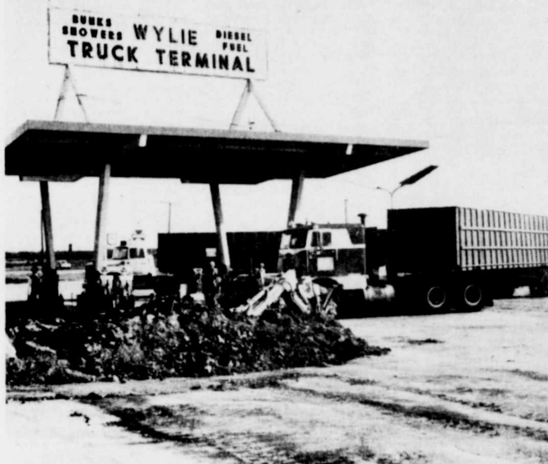
NO DIESEL SALES--This was the scene Saturday at the Wylie Truck Terminal on 120 as independent truckers parked their trucks at most truck terminals in Texas. The truckers were protesting higher fuel costs and lower speed limits.

He is assistant chief, urology section, Letterman Army Medical Center.