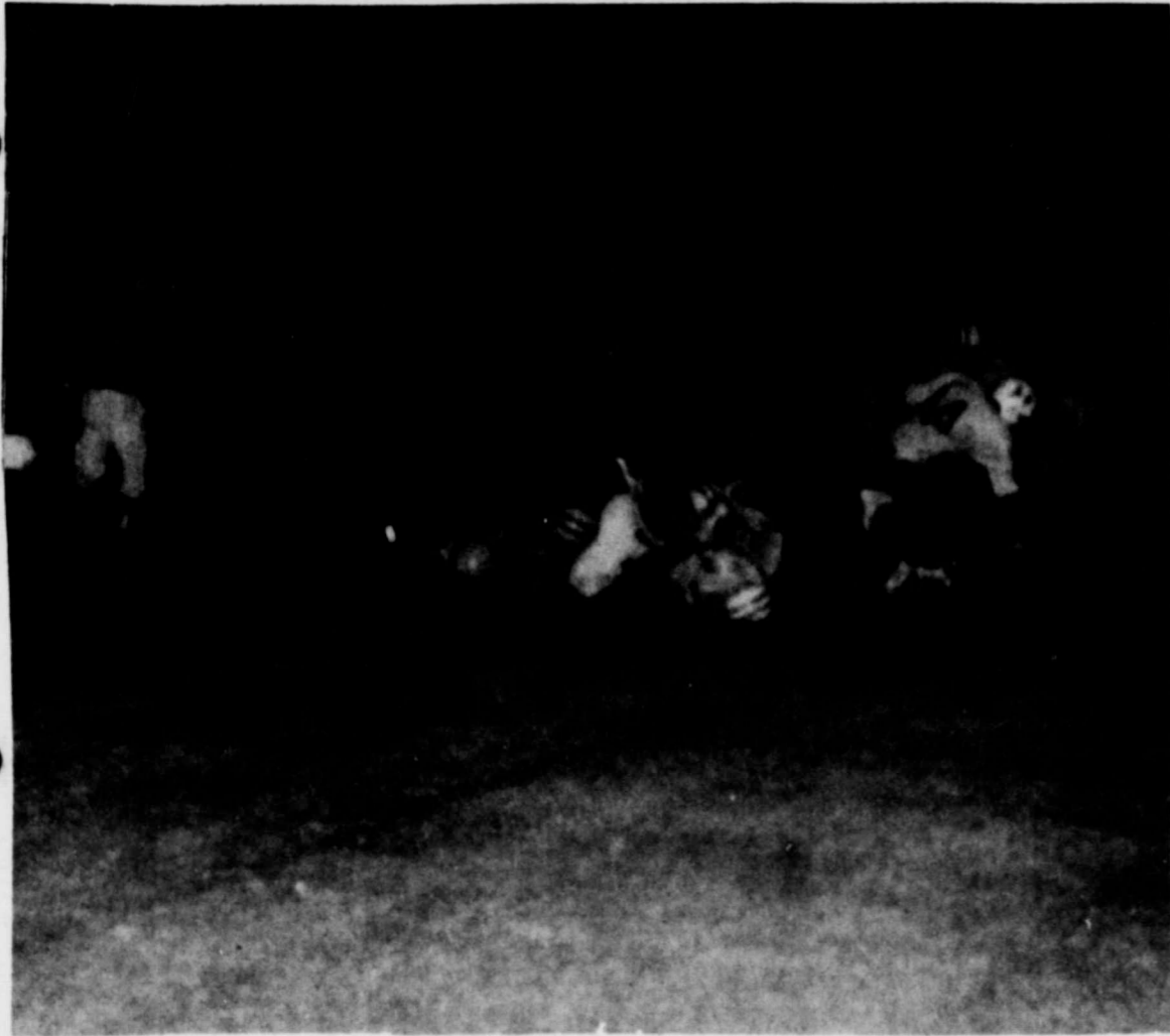
BADGERS MAKE TACKLE ... Merkel Badgers stop Indians on 35