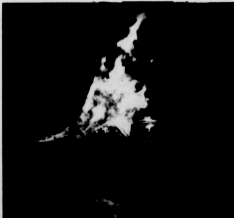
BADGER BON FIRE... prior to Homecoming game

Placements during September totaled 34,000 head with a total of 10 feeders reporting 1,000 or more head on feed as of Oct. 1. Marketings during September totaled 50,000 head.