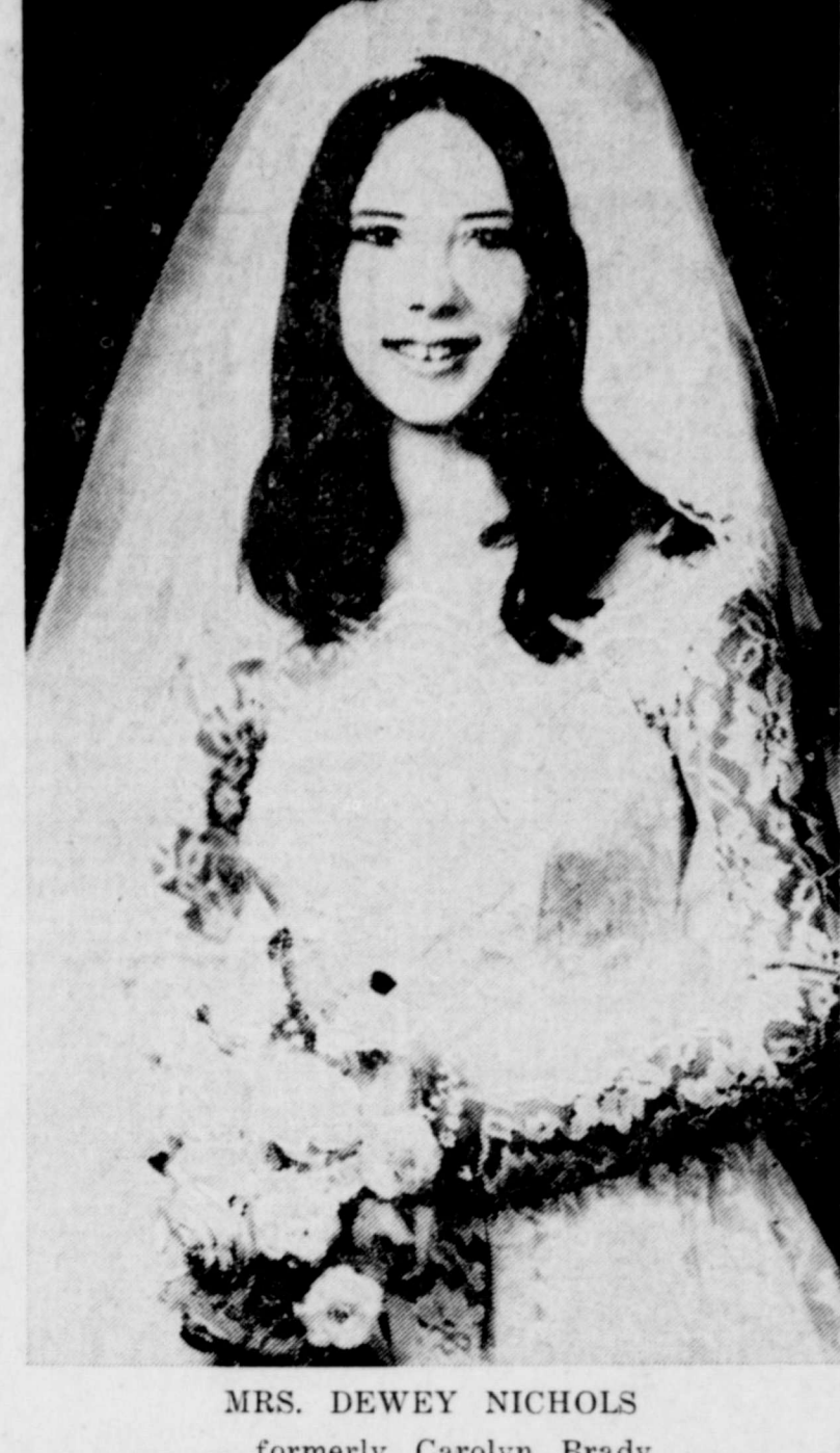
... formerly Carolyn Brady

The plug-in-timer controls appliances up to 1800 watts and lamps to 840 watts. For added convenience, an override knob on the front of the timer allows one to turn lamps or appliances on or off without disturbing either the automatic or manual settings.