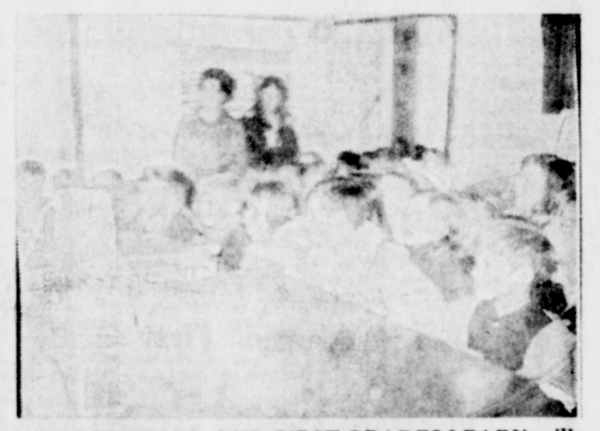
KINDERGARDEN AND FIRST GRADES LEARN milk comes from a cow rather than a carton.