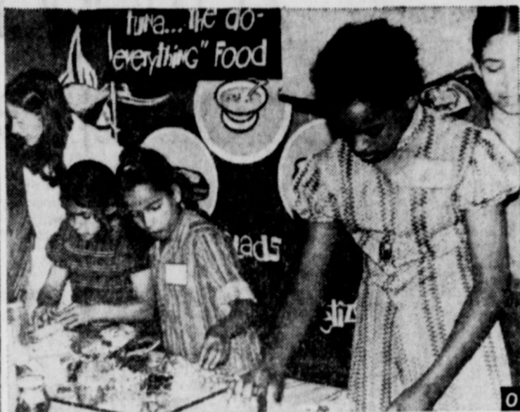
Tuna sandwich sweepstakes at New York City's famous Grand Street Settlement was recent summer "happening".

One all-time winner—sweepstakes or not—is the Tuna Burger. It's easy to make and nourishing too, because canned tuna has complete protein, comparable to lean beef.