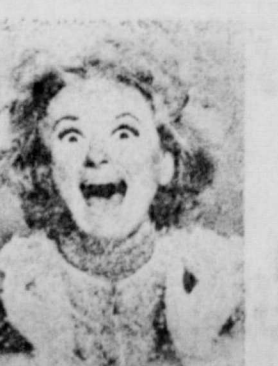
"My natural beauty usually attracts so much attention that drivers take their eyes off the road to stare at me and they run into telephone poles and fire hydrants. It's a mess. But you Texans keep your minds on your driving. You don't give beauty more than a quick glance.