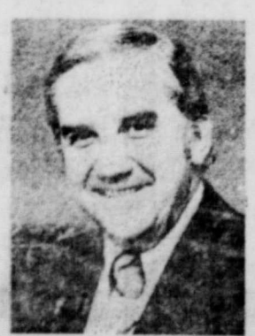
"I admit I do eniav a nip every once in awhile. But I never drink when I'm going to have to do the driving home. If you plan to drink, let someone else drive. That's just one more way to drive friendly