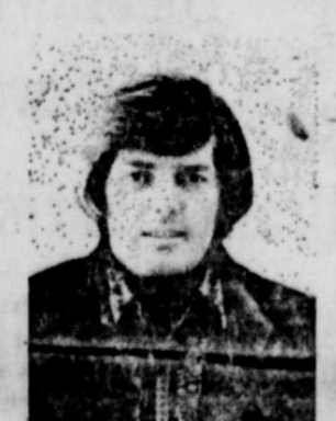
the Lettermen enjoy more than putting together a little close harmony... On the highway we make harmony by blending in with traffic. Driving Friendly to make it all work together,"