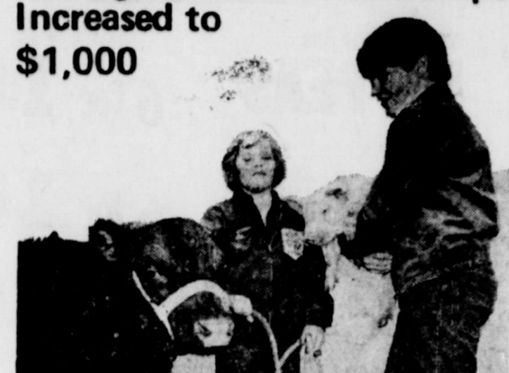
as these Will County, Ill., young people demonstrate.

within ninety days after the date June A.D. 1972.