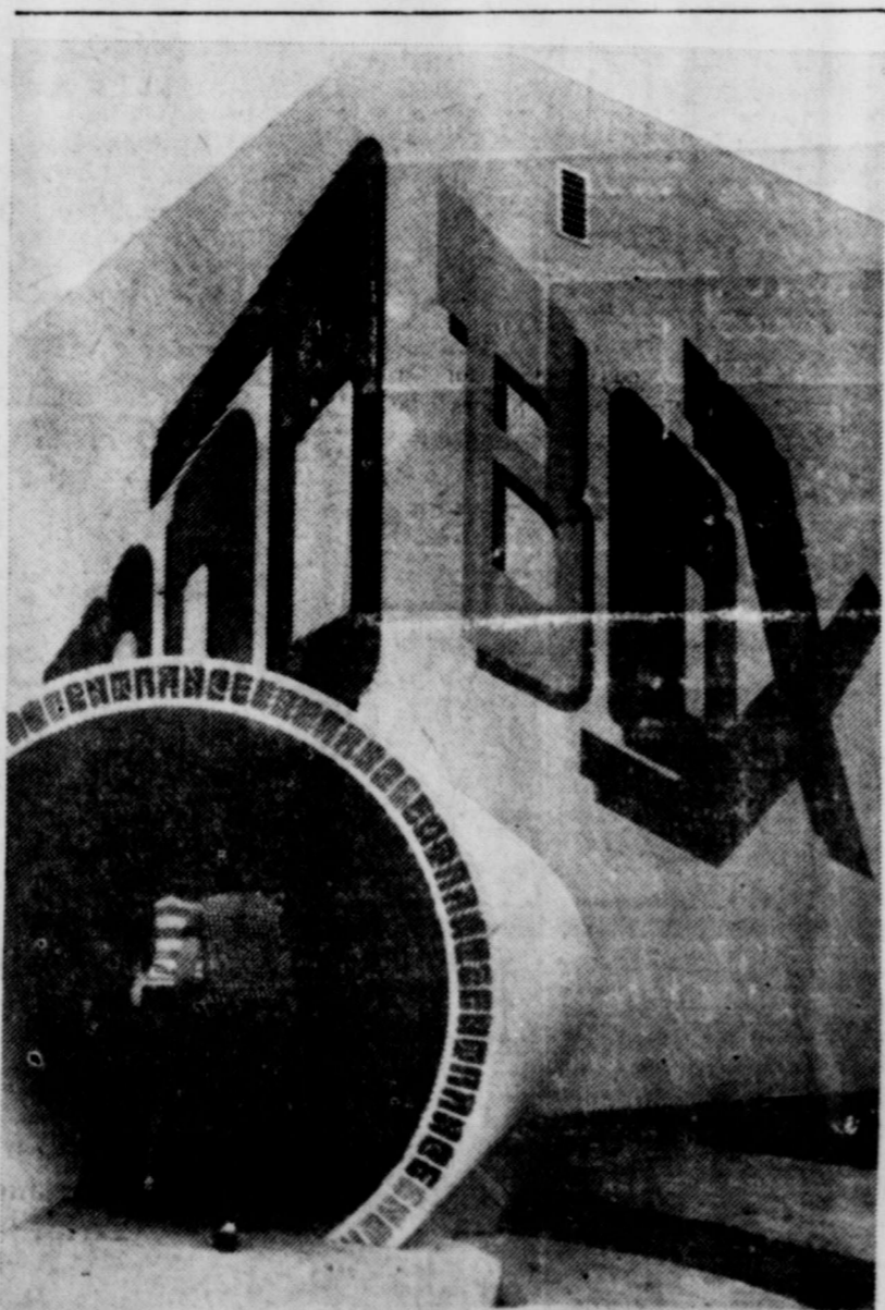
TUNNEL OF FUN — Houston's great air-conditioned family - entertainment center, Astroworld, USA, celebrates its fourth summer with a new Mod Box for the "now" generation. The kids say it's well worth the "trip."