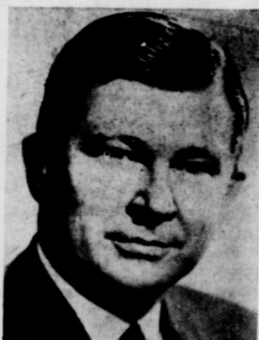
SENATOR JOHN TOWER ... special speaker