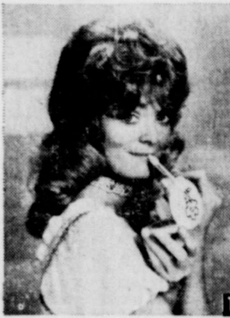
Ingenious cosmetics offer more than just lip service.

Max Factor's timely contribution to the scene is the first complete collection of hypo-allergenic, dermatologist-tested products for the face,