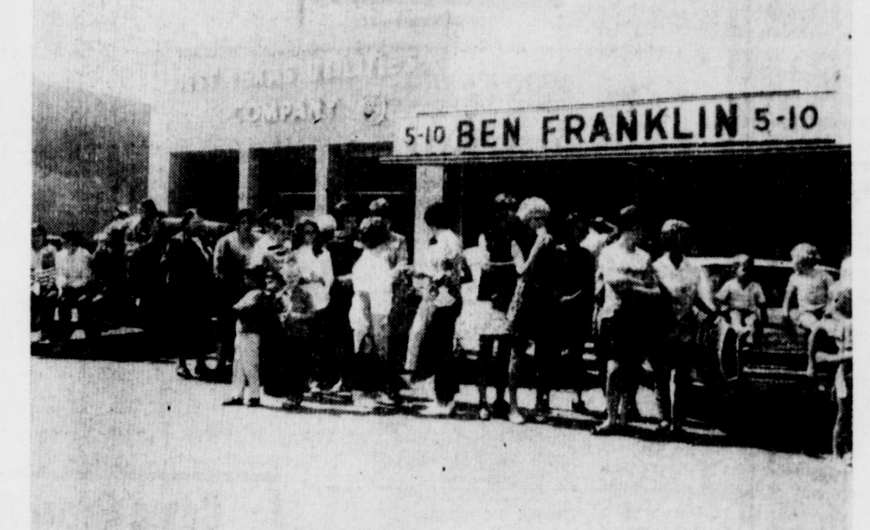
PARADE VIEWERS — A good - sized crowd gathered on the streets of Downtown Merkel Saturday to get a "good look" at Homecoming candidates, cheerleaders, Badger Band, and the new 1970 automobiles carrying parade participants.