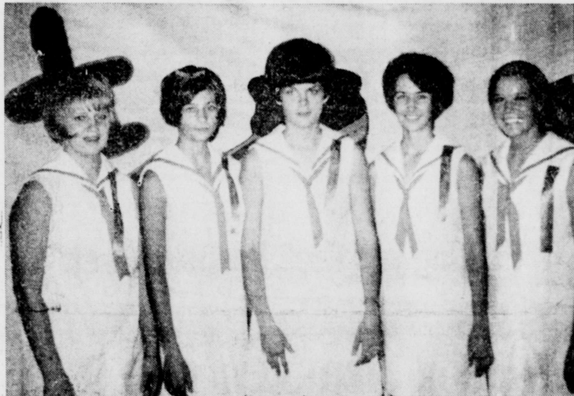
TO PERFORM AT HOMECOMING GAME — Merkel High School Cheerleaders (left picture) will do a little extra cheering for the hundreds of exes who will be in the Badger Stadium for Saturday evening's football game with Haskell.

"All Exes who are in Merkel early are invited to this special event."