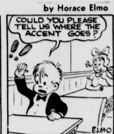
THE MERKEL MAIL, MERKEL, TEXAS Page Two Thursday, May 23, 1968