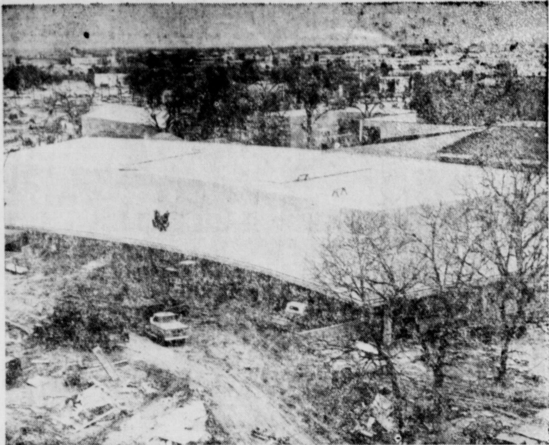
UNITED STATES PAVILION—Work on the exterior of the United States exhibit hall, one-half of a $6.75 million pavilion complex at HemisFair '68, nears completion and attention is turned to the interior design. This picture of the structure, marked by the United States Seal, was taken atop the Swiss Skyride already in operation at the San Antonio World's Fair.