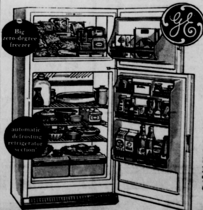
'Two Door 14' 13.5 cu. ft.