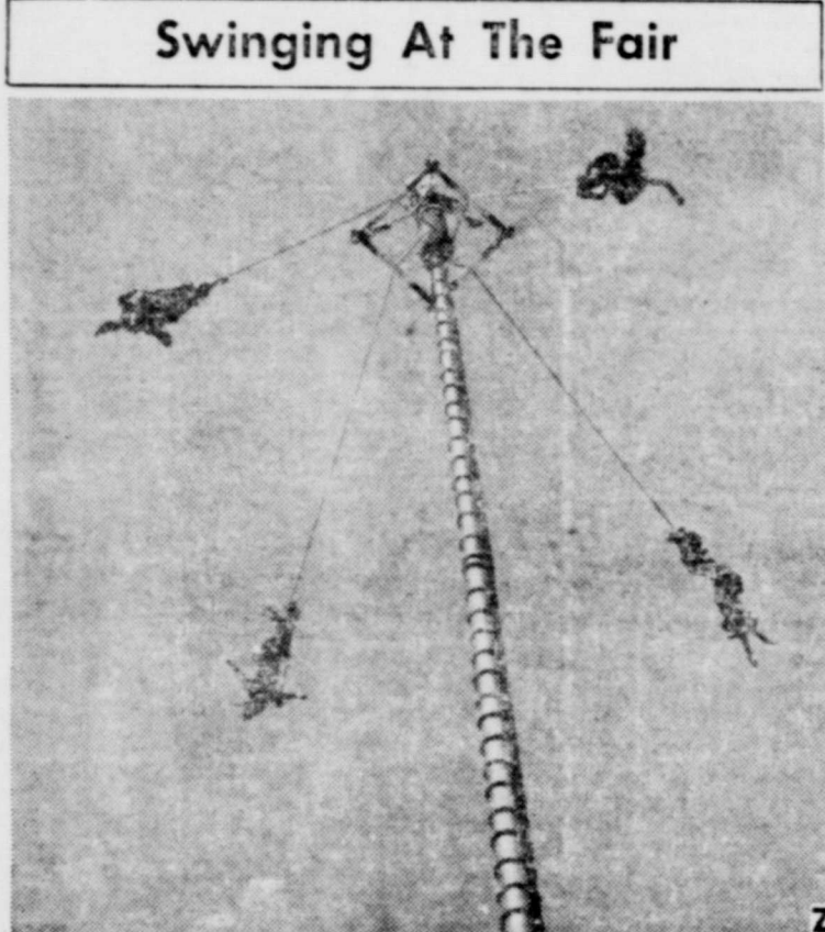
Swinging At The Fair

When HemisFair '68 opens April 6, in San Antonio, Texas, visitors will note one point: this is a fair in motion. Fairgoers will be able to enjoy a stately gondola glide down the San Antonio river—where Victorian houses along the banks—some 100 years old—have been restored and will be used as restaurants for various nations.