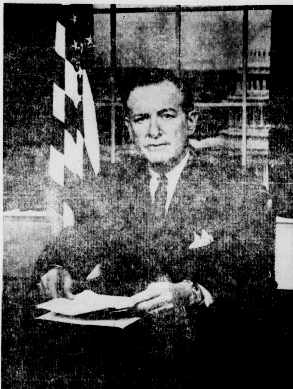
Congressman Omar Burleson

The achievements, fiscal responsibility and service of Congressman Omar Burleson may be obtained at Campaign Headquarters, 306 Cypress Street, Abilene, Texas. A record of Congressman Burleson's votes FOR and AGAINST measures before the House of Representatives is also available. This is the best way for you to inform yourself of facts calmly and unemotionally, and we think you would like to do this before the election Saturday, May 7.