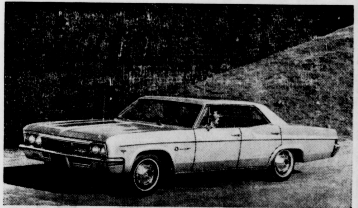
1966 Impala Sport Sedan—a more powerful, more beautiful car at a most pleasing price.

If you haven't examined a new Chevrolet since Telstar II, the twist or electric toothbrushes,