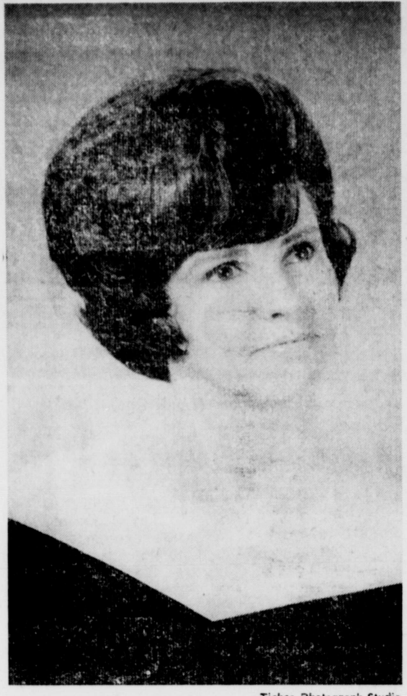
Tiches Photograph Studio

of our Action Sale at Blackwell Grocery, Blackwell, Texas. Beginning at 1:30 p.m. Saturday, April 9.