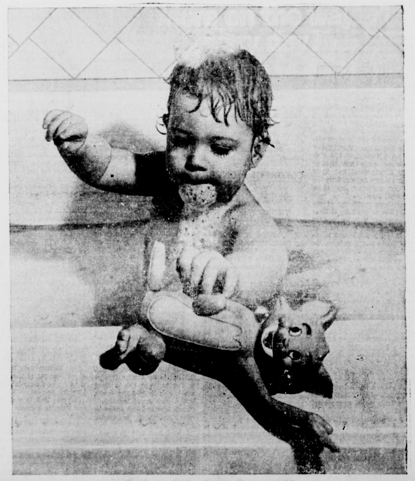
Rub-a-dub-dub, 2¢ a tub

Member of Federal Deposit Insurance Corp.