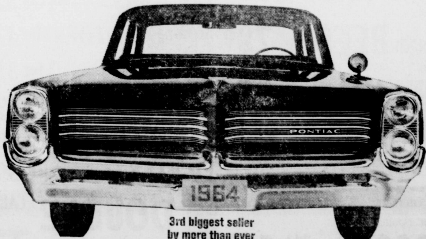
3rd biggest seller by more than ever

The important thing about being popular is staying that way. Wide-Track Pontiac