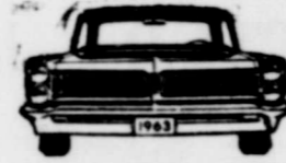
3rd biggest seller 1963

The important thing about being popular is staying that way. Wide-Track Pontiac