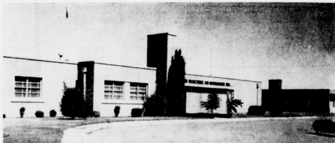
Home of Taylor Electric Cooperative