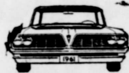
3rd biggest seller 1961