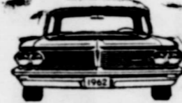
3rd biggest seller 1962