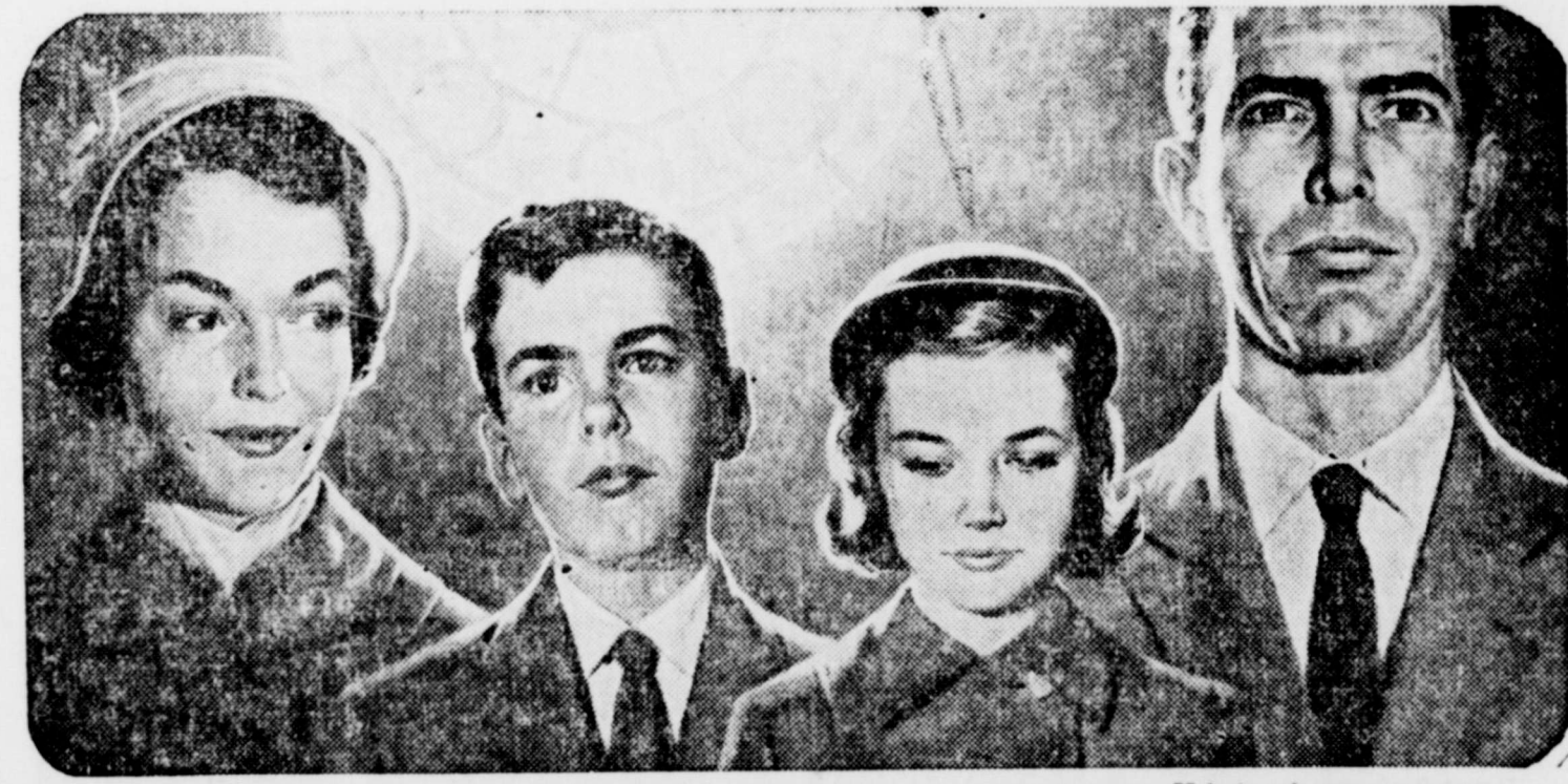
Help is only a prayer away