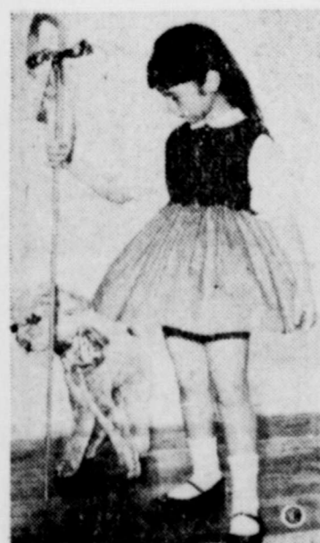
PARTY-TIME —And the young miss chooses a Bavarian-inspired cotton with a black velvet jernkin, dainty tucked bodice, and bright red bouffant skirt. By Cinderella.