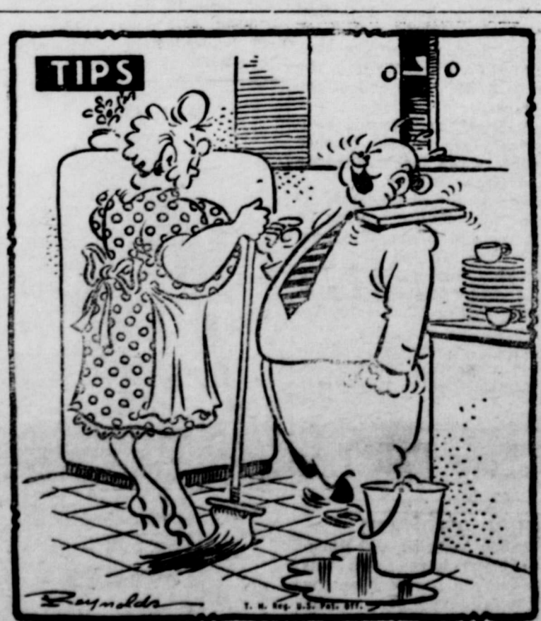
"Start something-and we'll see how those vitamins I got in the Want Ads are working out!"

The physician said the drug he used neutralizes the actions of substances that seem to be responsible for these skin eruptions. At the same time, it doesn't cause un-due drowsiness or impair mental alertness.