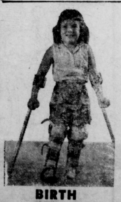
DEFECTS NEW target ... NEW hope

Members of the sorority voted fund raising project necessary The Lions took an 11-7 first each year to pay the local dues