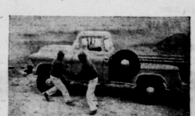
Final effort achieves summit! Pickup conquers Pikes Peak . . . shows why Chevrolet trucks are famous for staying and saving on tough jobs! Talk