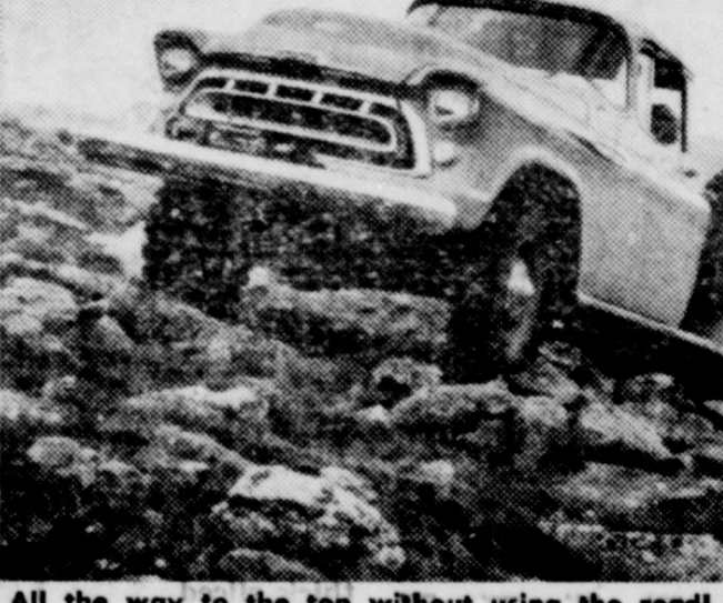
All the way to the top without using the road! Here the truck scales high boulder pile near the 14,110-foot summit.