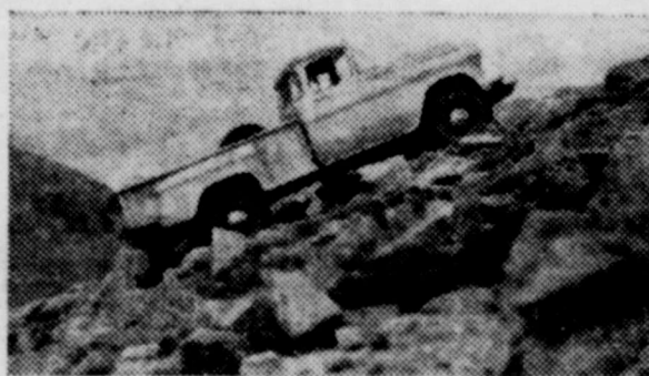
Miles of loose boulders and thinning air offer extreme challenge. Yet the big Chevy engine never faltered; it performed flawlessly mile after mile, all the way up the mountain!