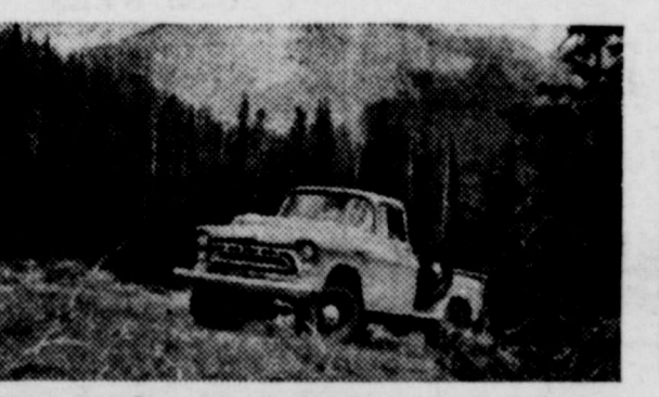
Steep grade near timberline—a rugged test of power. The power and torque of Chevrolet's famous Thriftmaster 6 proved more than a match for the most difficult grades.