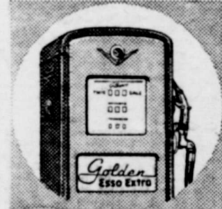
PREMIUM OVER PREMIUM

For cars with very high compression engines and cars that tend to knock on "Premium" Gasolines: This is the world's finest automotive gasoline. It has the highest octane rating in town—highest by far. This outstanding quality improvement paces others that rate the performance of Golden Esso Extra as "premium over premium . . ." If your car requires Golden Esso Extra quality, you save the extra cost through improved performance, operating economy, added gasoline mileage.