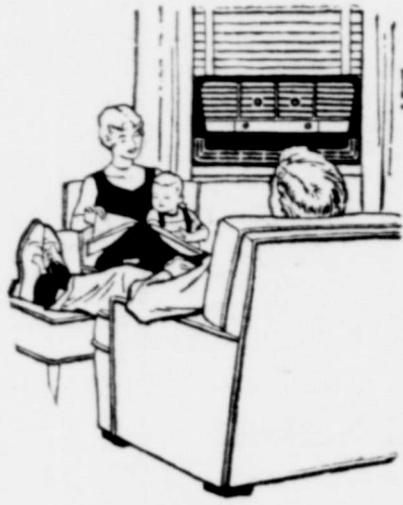
RELAX IN COMFORT in your air conditioned living room.

*Electric service, today's biggest bargain. In West Texas homes, the average cost of a kilowatt-hour of electric service is 22% less than it was 10 years ago.