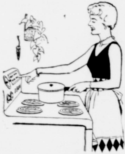
WORK IN COMFORT — electric range helps keep cook and kitchen cooler.

MORE COMFORT WHEN YOU LIVE ELECTRICALLY!