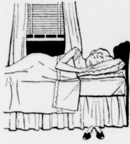
SLEEP IN COMFORT — Electric room air conditioners help keep bedrooms cool.

MORE COMFORT WHEN YOU LIVE ELECTRICALLY!