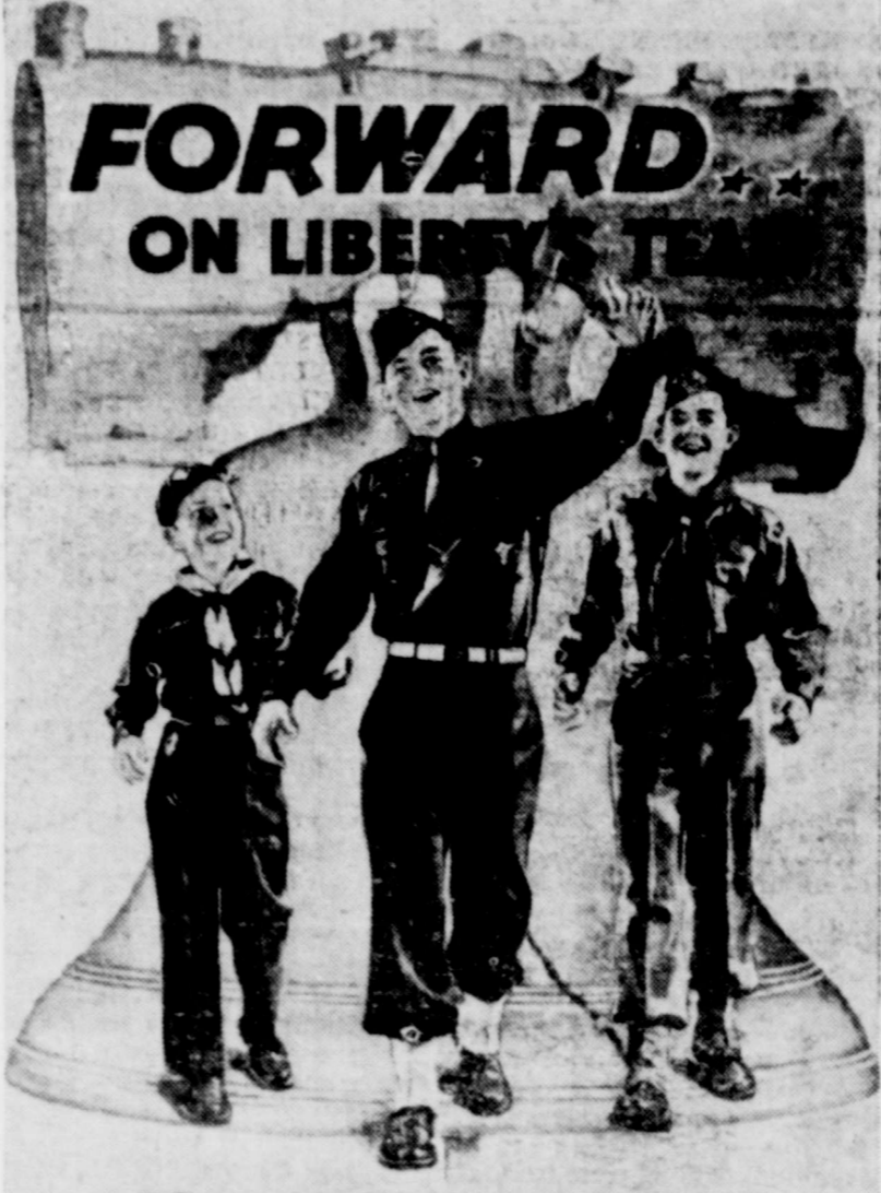
Official Boy Scout Week Poster

Boy Scout Week, Feb. 7 to 13, marking the 43rd anniversary of the Boy Scouts of America, will be observed throughout the nation by more than 3,250,000 boys and adult leaders. Since 1910, more than 20,200,000 boys and men have been members. "Forward on Liberty's Team" is the birthday theme and the emphasis is on "The Scout Family" of programs meeting the interests of boys in three age groups: Cub Scouting for boys 8, 9 and 10; Boy Scouting for those 11, 12 and 13 and Exploring for boys 14 and up. The high point of Scouting in 1953 will be the third National Jamboree. More than 50,000 Boy Scouts will camp at a 3,000-acre tent city on the Irvine Ranch in the Newport Harbor area of southern California next July 17 to 23.