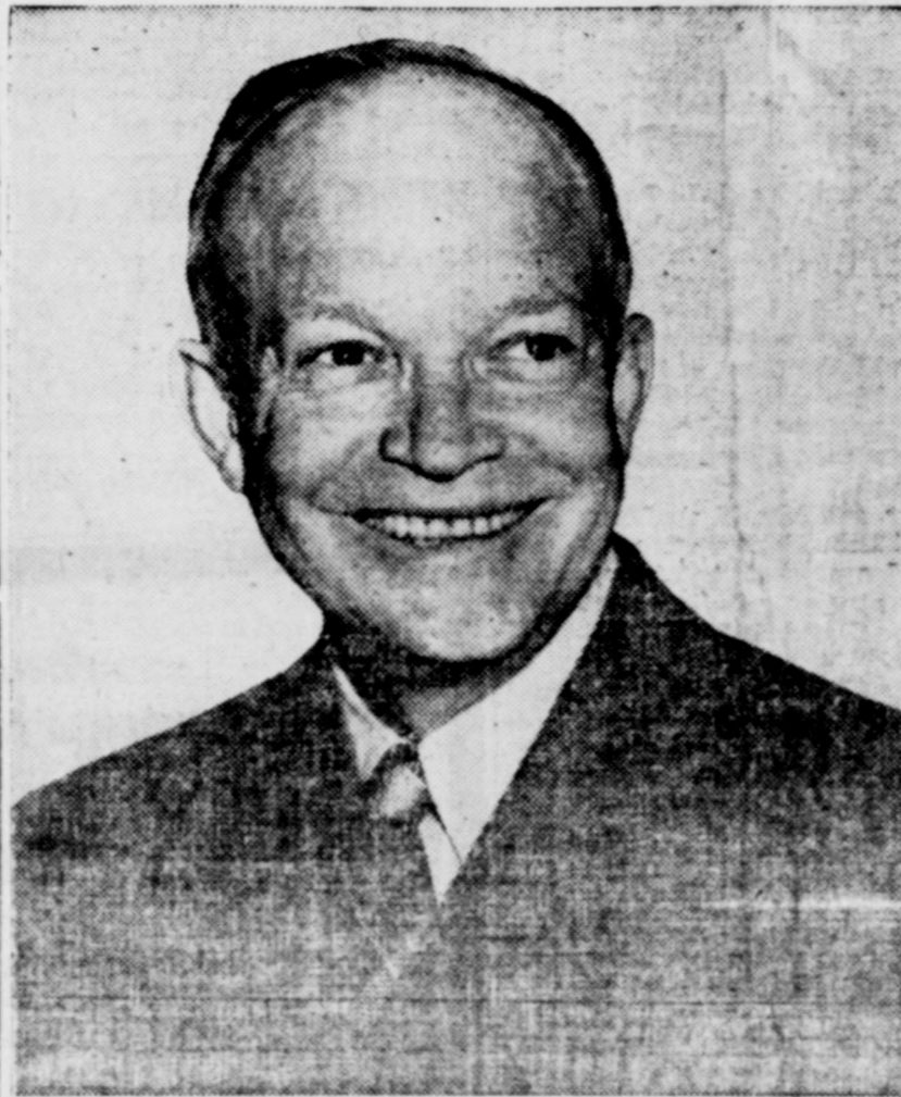
DWIGHT D. EISENHOWER