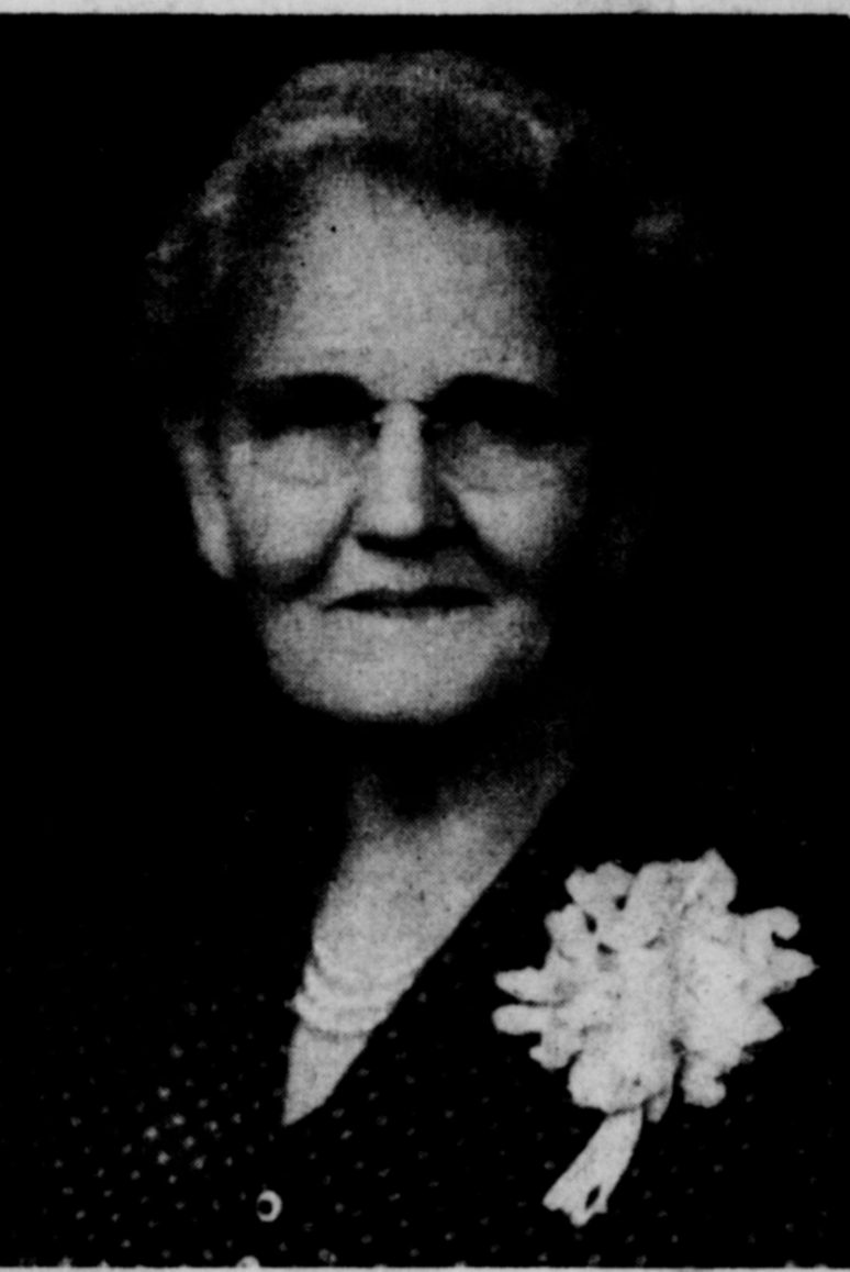
To Mom . . . whose loving smile is our encouragement when we feel despondent . . . who darns our socks and cooks our favorite dishes and fills our home with warmth and security . . . who devotes herself to keeping us well and happy and whose only reward is her secret pride in our successes and achievements.