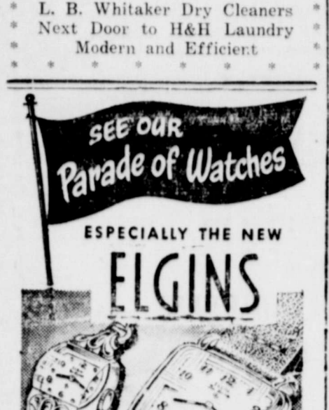
The DuraPower Mainspring* is in all new Elgins. Eliminates 99% of all repairs due to steel mainspring failures.