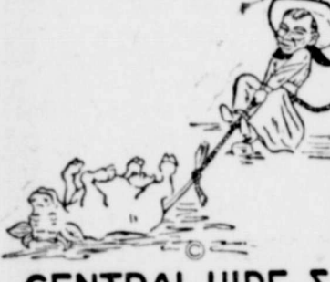
CENTRAL HIDE & RENDERING CO.