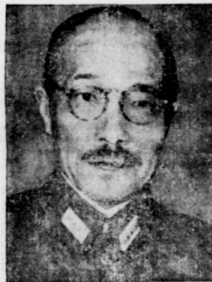
Lieut.-Gen. Hideki Tojo, Japan's new premier, shown speaking to the nation after his installation. His selection marked a new turn in the Japanese foreign policy.