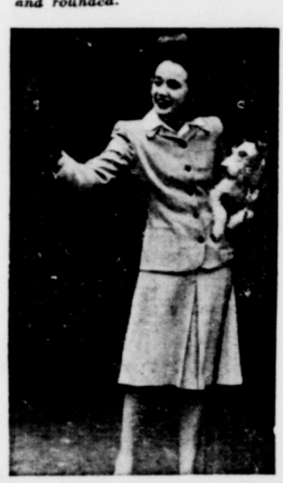
to the February Good Housekeeping are something to dream about. The peges of the magazine offer this one of wool gabardine which features a