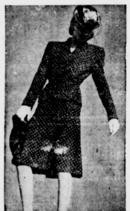
Looking for a spring suit? The February Good Housekeeping offers this chic suit of navy wool high-lighted by the perennially fashionable note of polka dots.