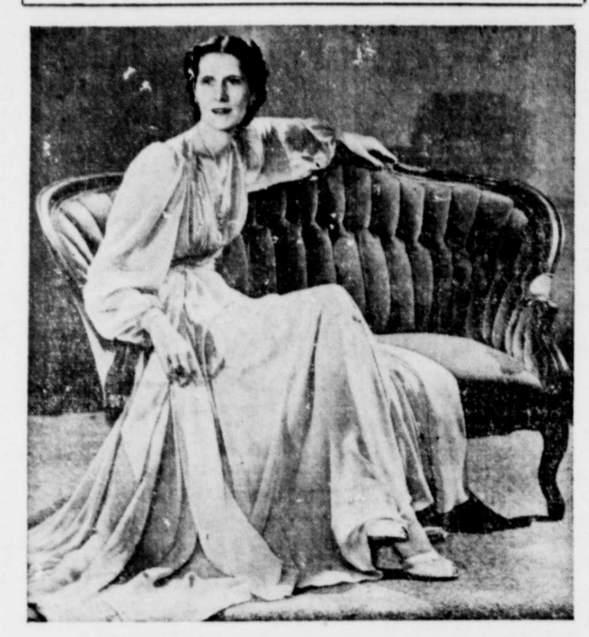
A perfect figure, says the February issue of Good Housekeeping, is not an essential of high fashion. This woman, obviously too tall and thin, has chosen a beguiling feminine evening dress with full, draped bodice, flowing skirt. Loose sleeves, she says, make a thin woman look young