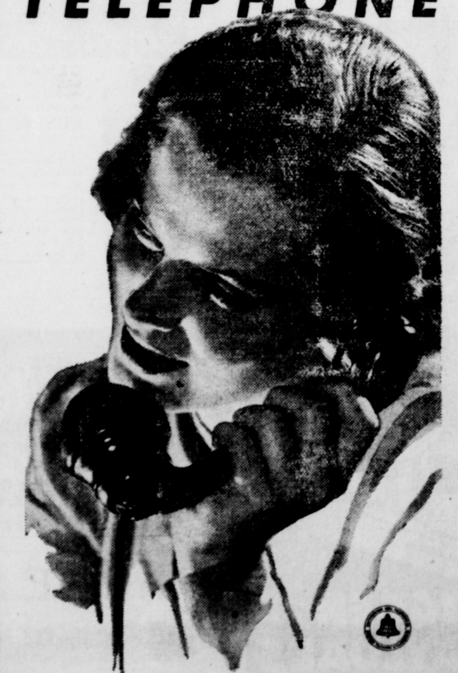
1. Be slow to hang up when calling. 2. Be quick to answer when called.

In the Southwest, 25,000 people a day hang up before the called party has a chance to answer.