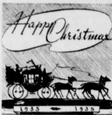
Simpson Mattress Factory

were never able to agree upon, but the world dissolved into an inferno of smoke and flame and the suddenness of it rocked the sky, upheaved the earth. The two came together with a cataclysmic roar. Furlong and Betty Durham were tossed headlong, flung down like straws. When they scrambled to their feet, dazed, shaken, terrified, it was to find themselves enveloped in a mighty dust cloud. The eighty-foot tower of heavy timbers was gone; in an instant it had utterly vanished. Where it had stood was a shallow, (Continued on Page 7.)