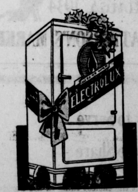
So Modern It Needs No Complicated Machinery

And the Gas Refrigerator runs for much less cost than any other method. Not a speck of noise or vibration. Beautifully finished and equipped with the latest improvements.